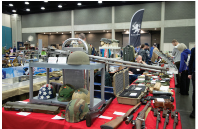
End of 2024 Show of Shows -30-